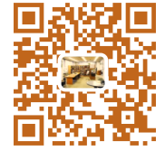
Communication Corner website (English)

You can also access the Communication Corner website by using the upper QR code on the right.