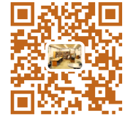
Communication Corner website (English)

You can also access the Communication Corner website by using the upper QR code on the right.