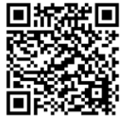
Payments to single-parent families

Contact: Children and Family Support Division (Kodomo-katei-ka, こども家庭課), tel.: 082-420-0941. Ministry of Health, Labor and Welfare (Kosei-Rodosho, 厚生労働省) Call Center, tel.: 0120-400-903.