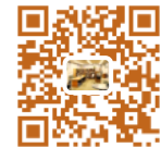
Communication Corner website (English)

You can also access the Communication Corner website by using the upper QR code on the right.